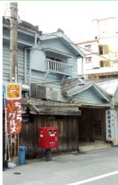
Illustration 1: Honbu Dojo in Okinawa